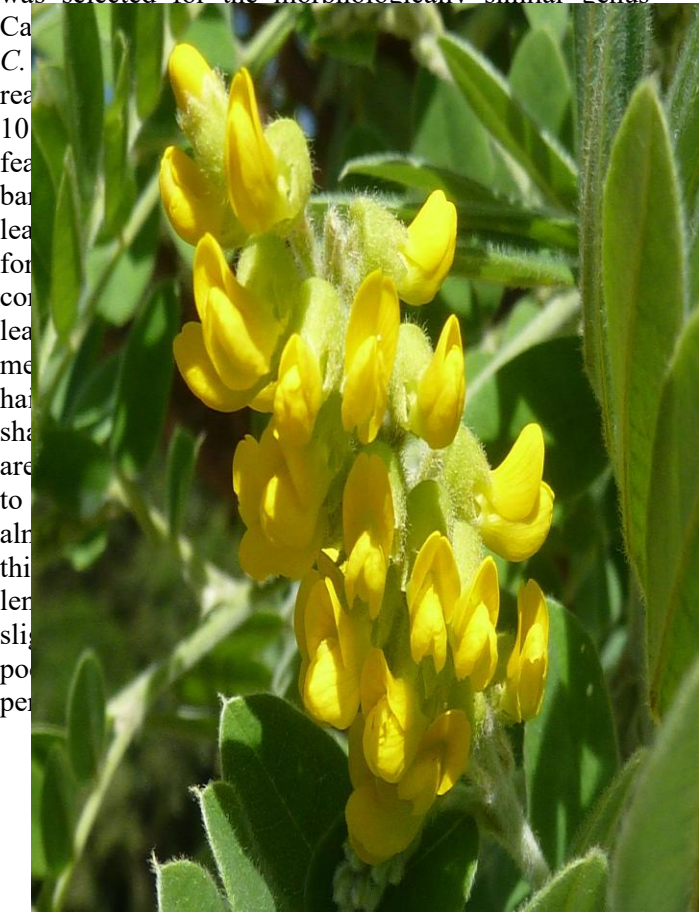
A. The golden yellow flower of C. aurea