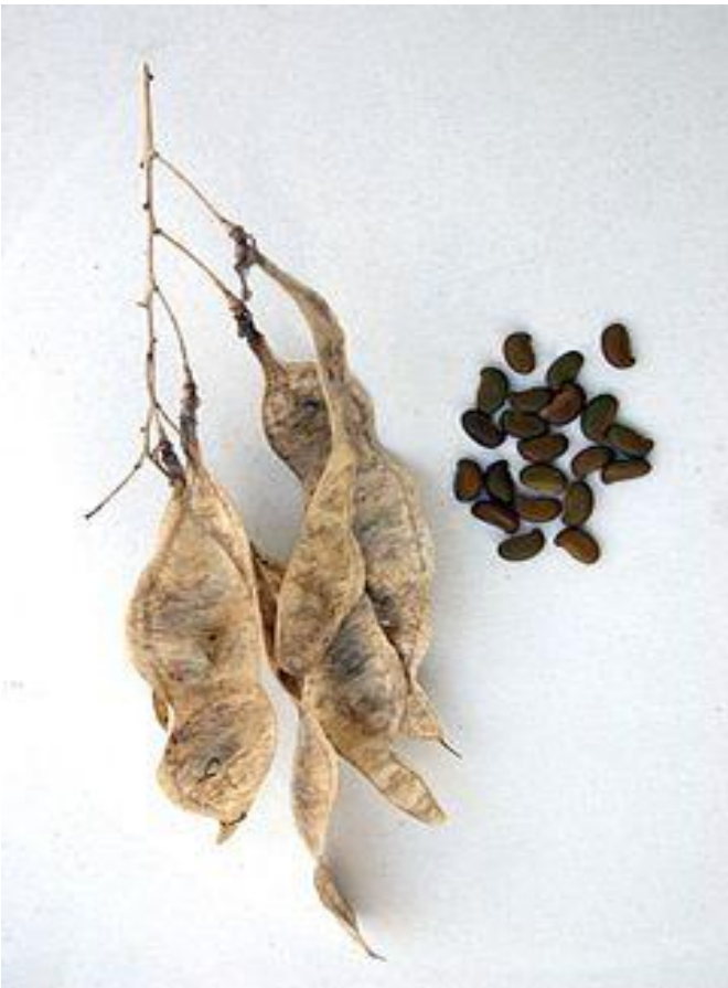
B. Pod and seeds of C. aurea As shown in Table 1, the species has different names in Ethiopia across different localities and societies.